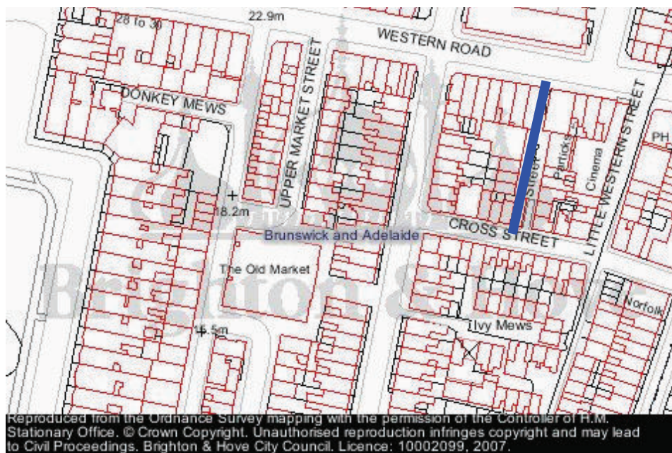
Fig 1 Farman St - location

Farman Street is a pedestrian lane which runs between Western Road and Cross Street.