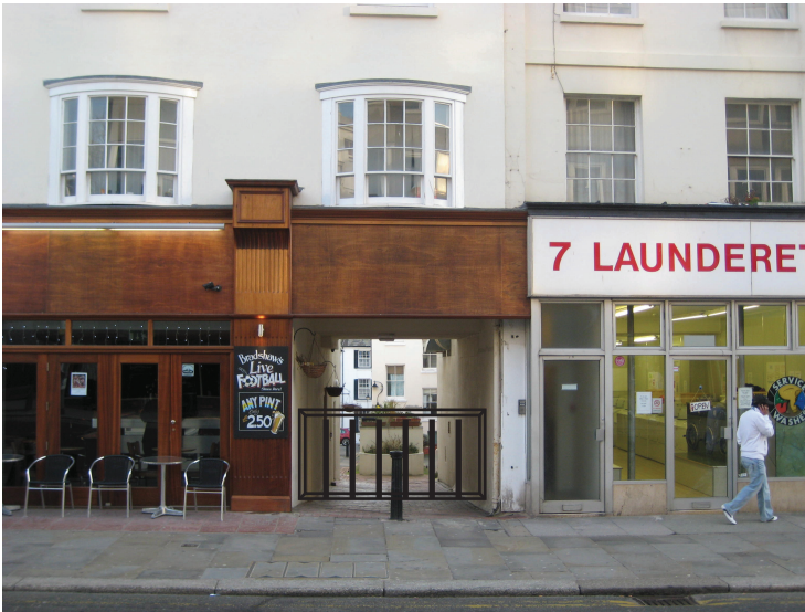
Fig 3– location of gate (illustration)

The following scheme has been developed in consultation with residents within and around the affected area.